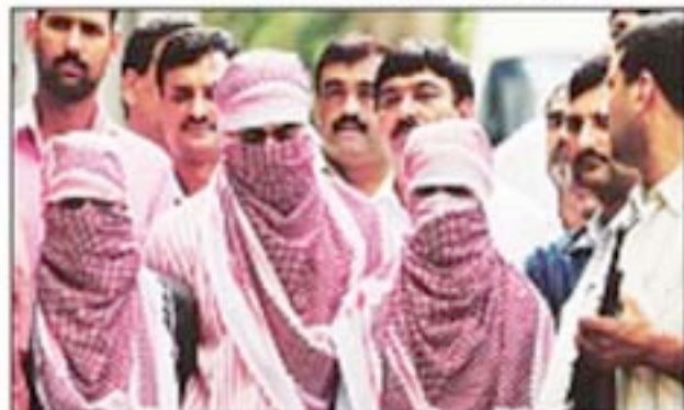
■ NOW THERE'S AN IDEA: Suspected Indian Mujahideen militants under arrest in Delhi